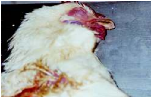
Bird infected with Avian Influenza