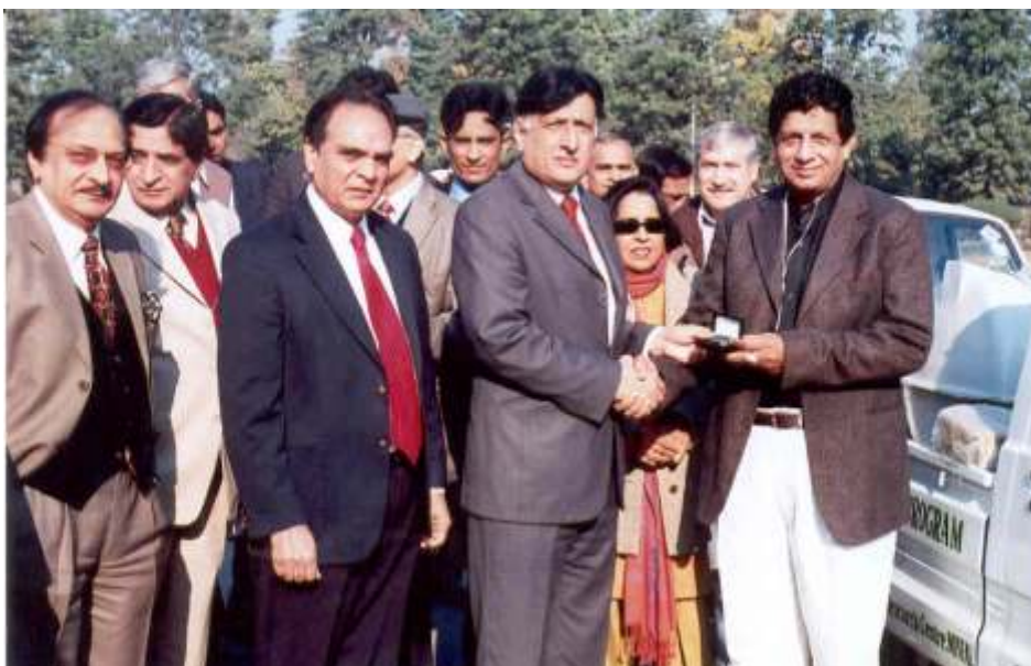
Secretary MINFAL and Chairman PARC handing over vehicle keys to provincial representative of Avian Influenza Rapid Response Units