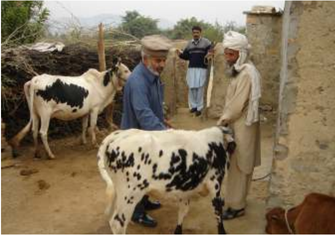
Drug efficacy field trial for control of warble fly in cattle