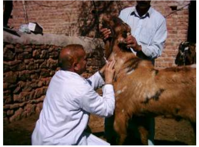
Blood collection from a diseased animal